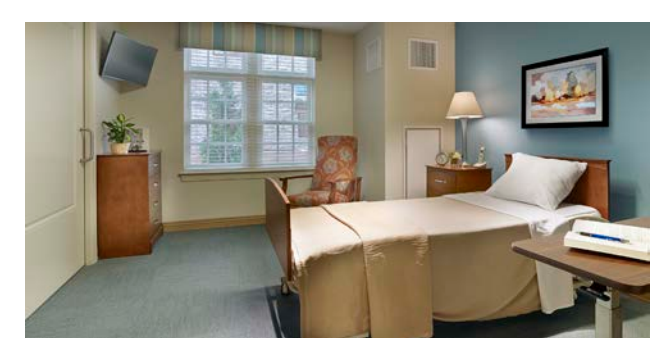
Private Bedroom Suite

You are supported by a highly-trained staff, 24 hours a day, 7 days a week, providing optimal quality of life and social interaction in a supportive home-like atmosphere.