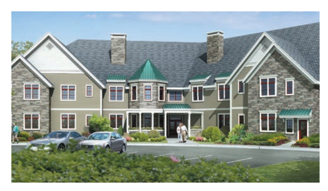
PARKER at Monroe Small Homes

PARKER at Monroe, newly constructed in 2014, consists of three two-story buildings connected to a Community Center . Each building contains two Small Homes , one on each floor. Sixteen Residents with similar needs live together in each Small Home . We provide skilled nursing care, including memory care services for individuals with all stages of dementias, who may also have complex physical needs.