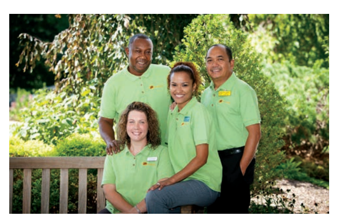
Caring Staff of Parker Home

PARKER is a not-for-profit organization with an exceptional reputation offering the best in affordable high-quality long term care services. Since 1907 we have provided nursing care, memory care, assisted living, adult day care and healthy aging services in personalized, home-like settings.