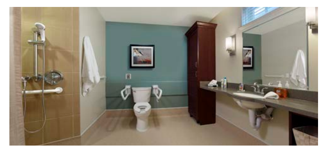
Private Bathroom with Shower

You will enjoy your comfortable private or semi-private bedroom suite with fully-accessible bathroom and spacious shower. The bedroom, bathroom and shower are designed to support your mobility and safety with easy assistance by care partners.